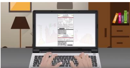
1. Fill It Online

There are two (2) parts of the Immigration Form, the Entry Form & the Exit Form. We will email you both forms already completed with the proper information and when you arrive in Mexico you will immediately proceed to the immigration booth at the airport where the immigration officer will keep the ENTRY Part of your form and he/she will stamp the Exit Part of the form which you will keep while in Mexico. When you are checking in for your flight back home, you will present the Exit Part of your form along with your passport.