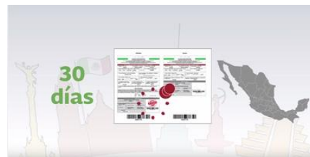
3. We'll Stamp It