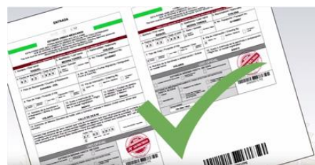
4. Welcome to Mexico!